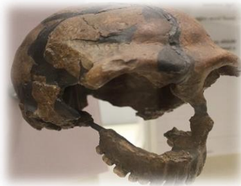
Fig 3. Neanderthal skull , Tabun Cave, Israel, The Israel Museum, Jerusalem.

In the study of biological evolution, paleontology and genetics represent two fundamental disciplines that provide independent yet deeply interconnected lines of evidence. Fossil records remain among the most of biological transformations across geological eras. Fossils are found within