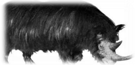
Fig. 2. Mammuthus primigenius , drawing by Kennis, 1999.