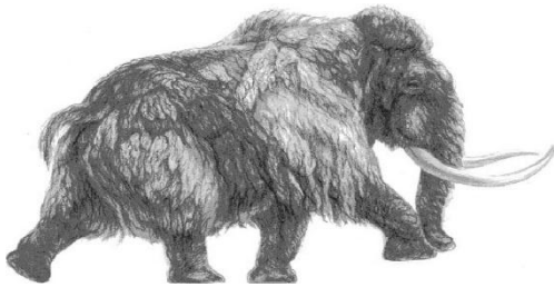
Fig.1: Coelodonta antiquitatis , Encyclopedia Britannica. www.britannica.com

diseases, migration patterns, and interactions among prehistoric populations. In practice, paleogenetics enriches paleontology by transforming fossils from simple “morphological objects” into biological archives capable of revealing, at the molecular level, the evolutionary history of animal and human life. In this integrated approach, paleontology supplies the stratigraphic, chronological, and morphological framework, while paleogenetics contributes genetic evidence that validates or reformulates evolutionary hypotheses, together enabling a more comprehensive reconstruction of the history of life on Earth.